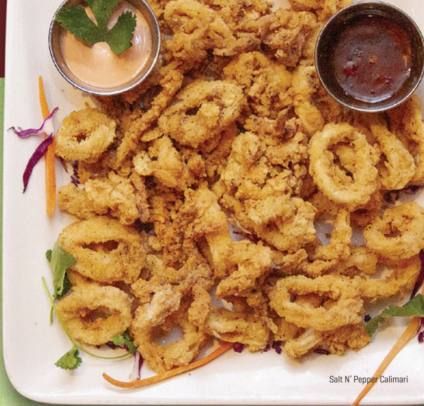
Salt 'N' Pepper Calamari