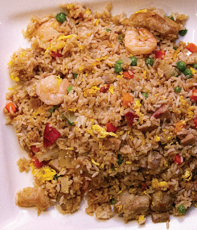
House Fried Rice

Your choice of meat sautéed with black mushroom, wood ears, onion, cabbage and served with two Mandarin pancakes with hoi sin sauce.