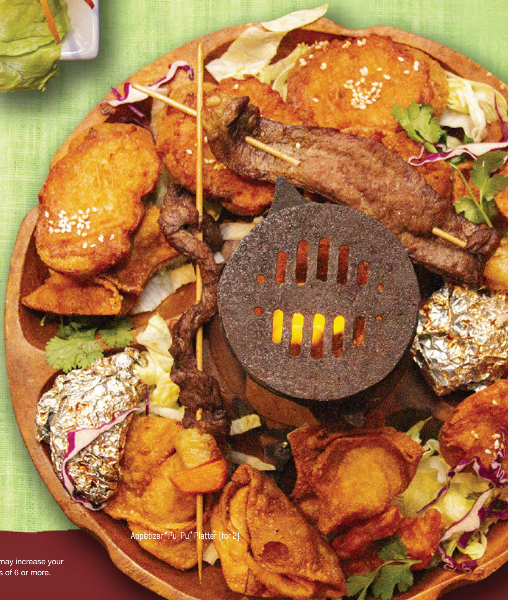
Appetizer "Pu-Pu" Platter [for 2]

Egg roll, crab puff, foil wrapped chicken, fried shrimp, beef sticker, wontons & shrimp toasts.