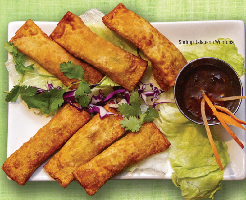
Shrimp Jalapeno Wontons