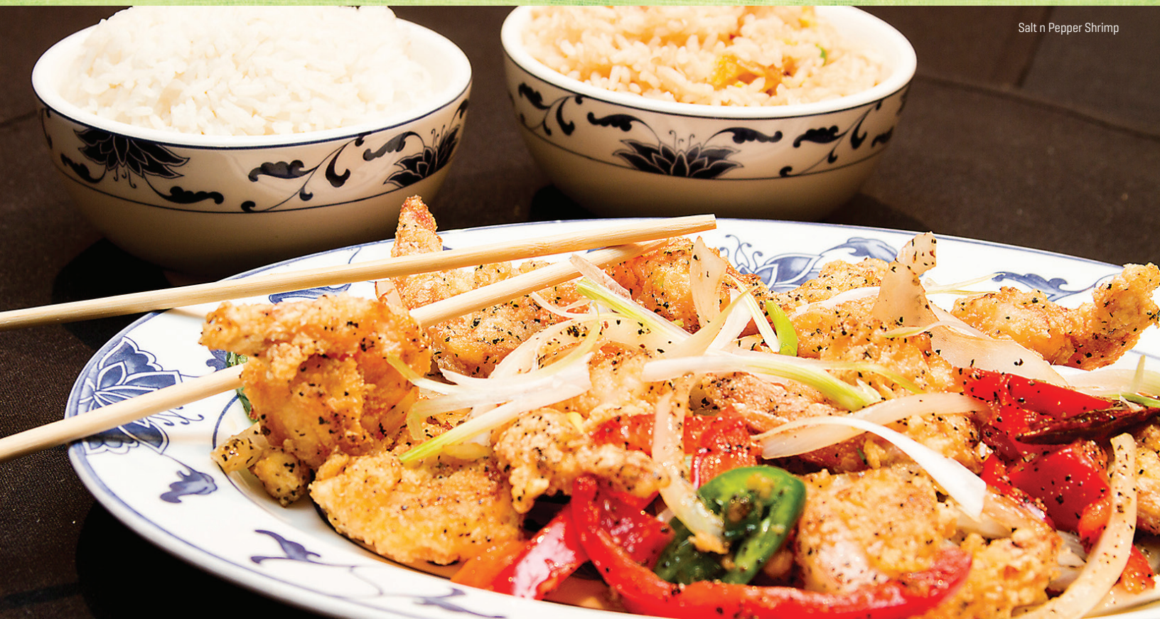
Salt n Pepper Shrimp