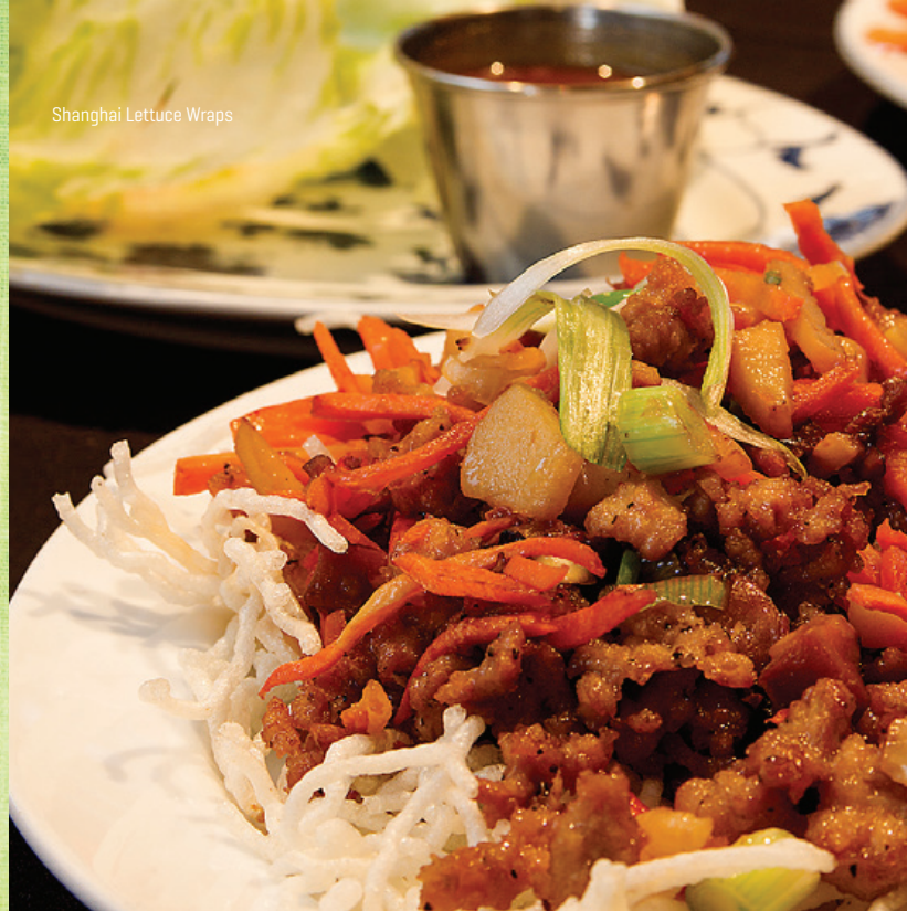
Shanghai Lettuce Wraps